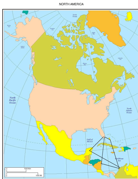
The map of Aerial smuggling routes