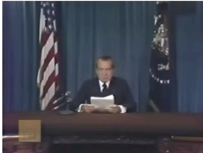
The resignation recording of Richard Milhous Nixon, the 37 th president of the United States. (August 8, 1974)

The morning that his resignation took effect, the President, with Mrs. Nixon and their family, said farewell to the White House staff in the East Room. A helicopter carried them from the White House to Andrews Air Force Base in Maryland. Nixon later wrote that he thought, "As the helicopter moved on to Andrews, I found myself thinking not of the past, but of the future. What could I do now?" At Andrews, he and his family boarded an Air Force plane to El Toro Marine Corps Air Station in California, and then were transported to his home La Casa Pacifica in San Clemente.