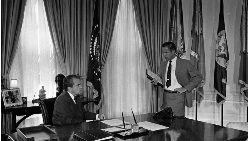
"Smoking Gun" tape of Nixon and H.R. Haldeman's conversation in Oval Office on June 23, 1972

75 were willing to vote against impeaching Nixon for obstructing justice. Goldwater and Scott told the president that there were enough votes in the Senate to convict him, and that no more than 15 Senators were willing to vote for acquittal—not even half of the 34 votes he needed to stay in office.